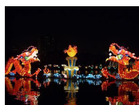
Mid-Autumn (Moon / Mooncake) festival, China